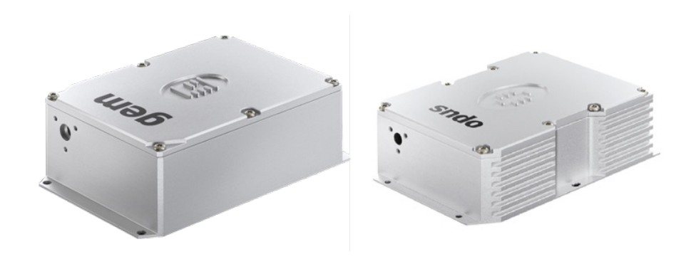
The gem and opus lasers from Laser Quantum

Advanced integrated power feedback is a defining feature of all Laser Quantum products. With this feature, the laser is able to intelligently maintain and optimize its own power levels in order to maintain beam specification with no power fluctuations, making them truly the laser of choice for high reliability, 24/7 system integrated applications.