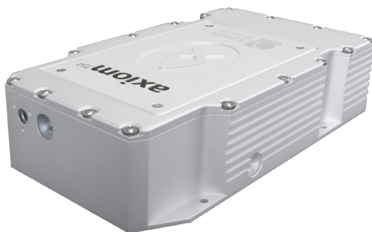
axiom LE laser from Laser Quantum

With its strong focus on OEM integration, Laser Quantum understands the importance of hands-free, remote maintenance and service. For this reason, every Laser Quantum laser can be securely accessed from any location on the globe in order to optimize performance or to troubleshoot.