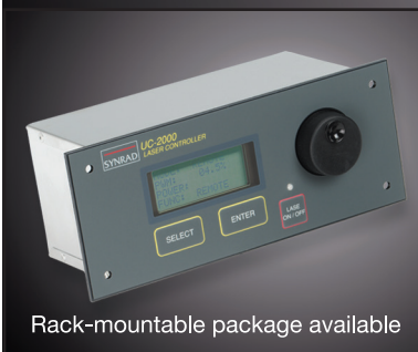
Rack-mountable package available